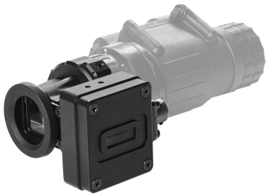
Single View-Module Version: NVR-714-S

The NVR-714 is the add-on plug-and-play system that attaches to the eyepiece of a night vision or daytime optical device and records the scene as viewed by an operator. It records what you see. An external display allows viewing the same image by two or more crew members. The NVR-714 is compatible with night vision monoculars, goggles, weapon sights as well as a wide variety of daytime optics.